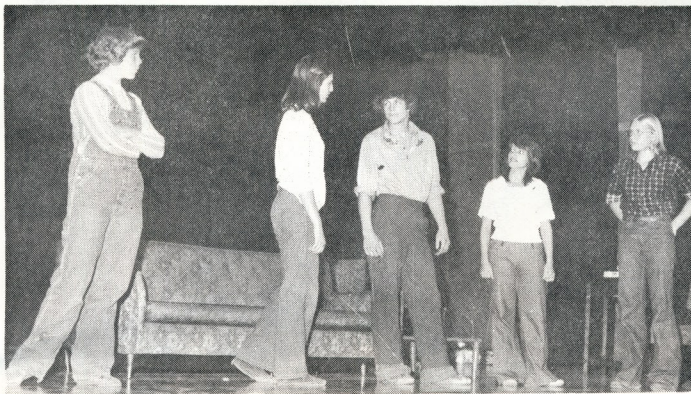
"He stopped us from having any fun!"

worthwhile. Later on this year there is a parliamentary procedure contest.