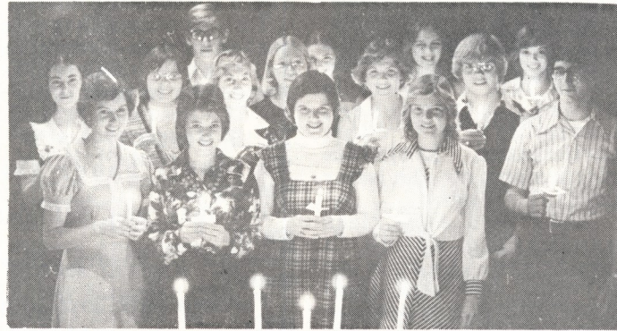
New National Honor Society Members

Task: Explaining report cards to parents