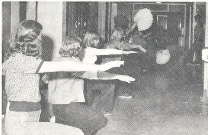
Pom Pom Practice

That our bomb threat had a very short fuse?