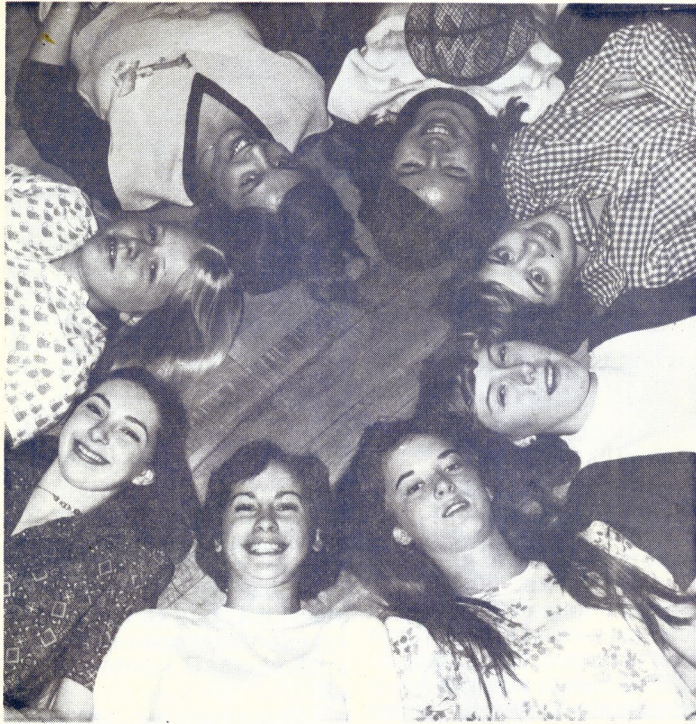
Winter Carnival has us going in circles!

FIND THE A-SQUAD GIRLS BB NAMES IN THE BELOW PUZZLE. THERE ARE 11. LOOK UP, DOWN, ACROSS, DIAGONAL, FORWARDS, AND BACKWARDS.