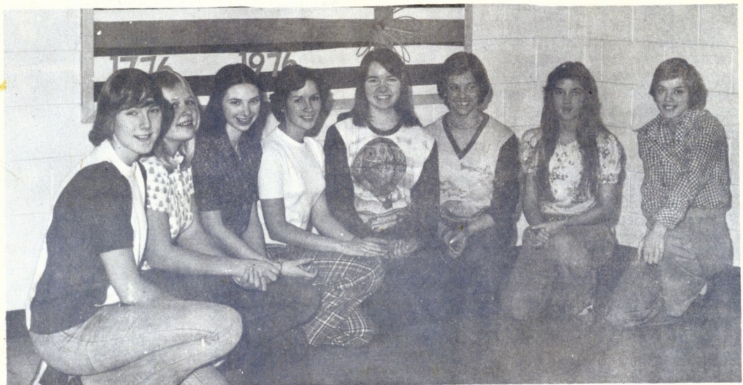
WINTER CARNIVAL CANDIDATES

Saturday night finished off the week with a great dance with Music by Black Diamond. But does anyone remember Tyrone Shoelaces?