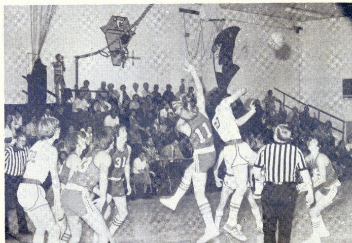
Tip and Skip