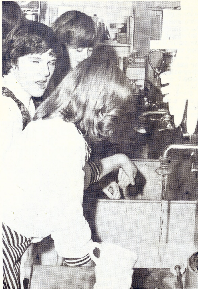
This is absolutely awful!