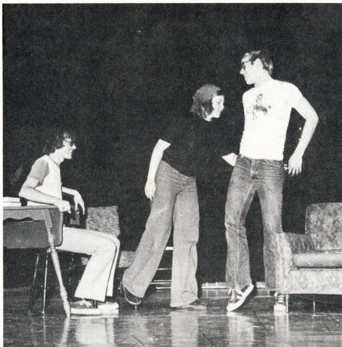
You said your Dad whopped you???

Now that it's over, What a relief it is!