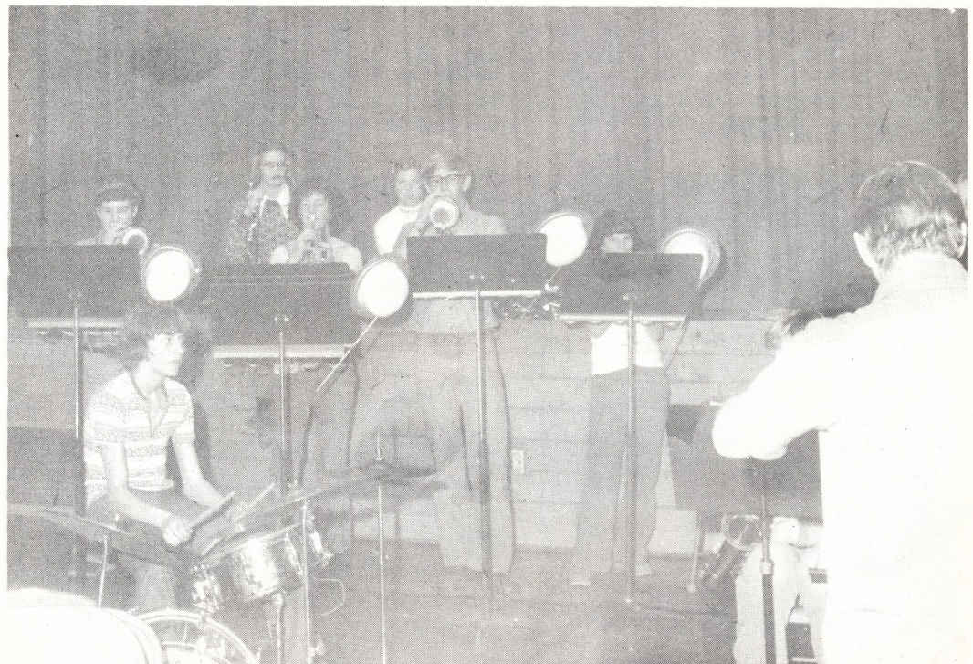
Who's got the beat?

Girls' P.E. is waiting for proper weather to go outside. Tennis seems to be one of the most popular of the outside games.