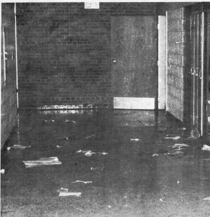
This seems to be the typical look of our halls these days. Let's get things cleaned up!

And best of all, our noon HOUR, or should I say our noon TWENTY MINUTES, could be spent relaxing.