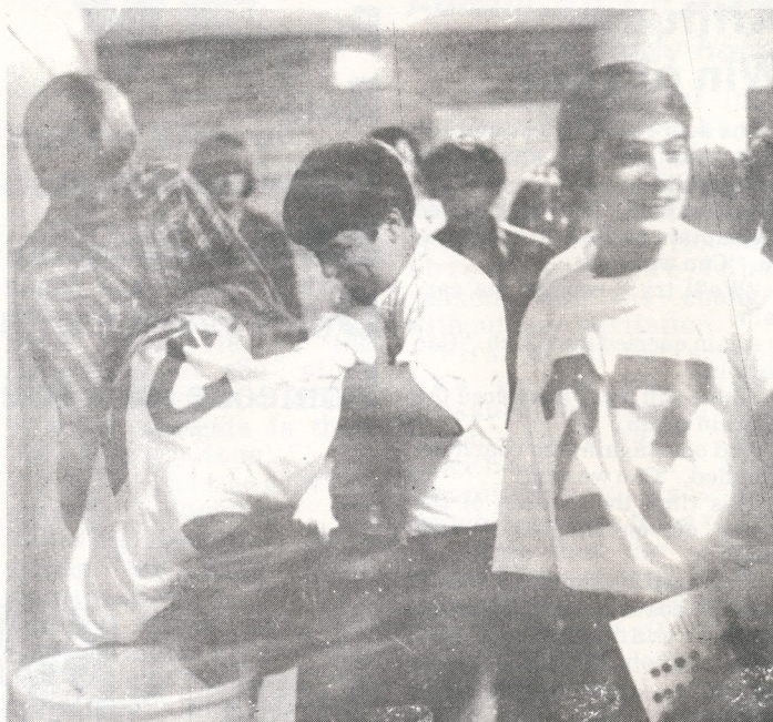
Cleaning up the school?