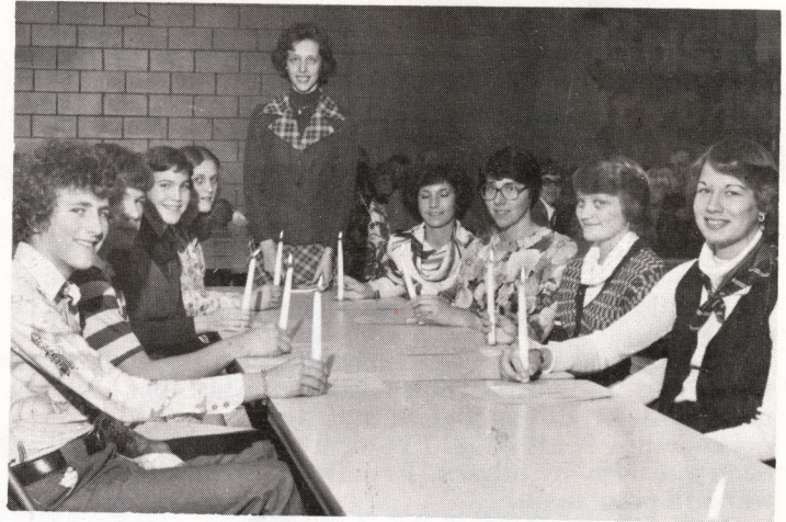
Honor Students Inducted

The students went to the Walker Art Center connected to the theater before the performance. The bus left the school at 10:30 a.m. and they returned at 7:00 p.m. later that day.