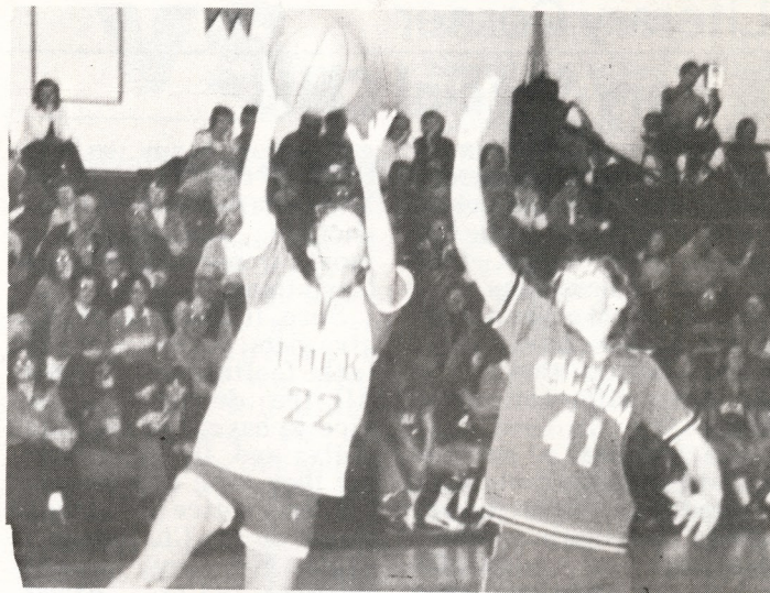
Cards On The Move!

Jan. 5 - Frederic, away Jan. 10 - Shell Lake, away Jan. 12 - Grantsburg, away Jan. 16 - Rush City, home Jan. 19 - Unity, home Jan. 24 - Prairie Farm, home Jan. 26 - St. Croix Falls, away Jan. 28 - Conference Meet, Frederic